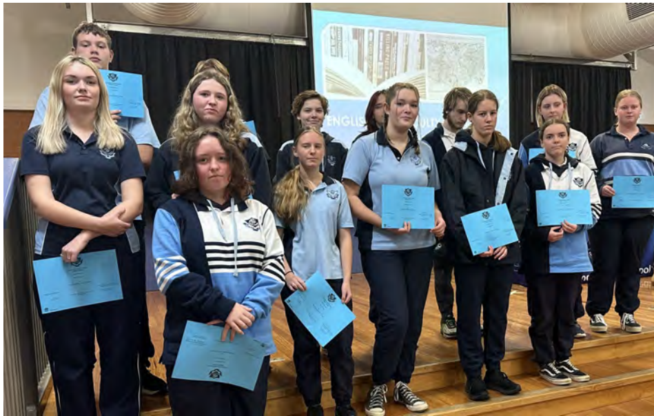
English Subject awards

At our Week 8 assembly students were rewarded for their hard work in English and HSIE subjects.