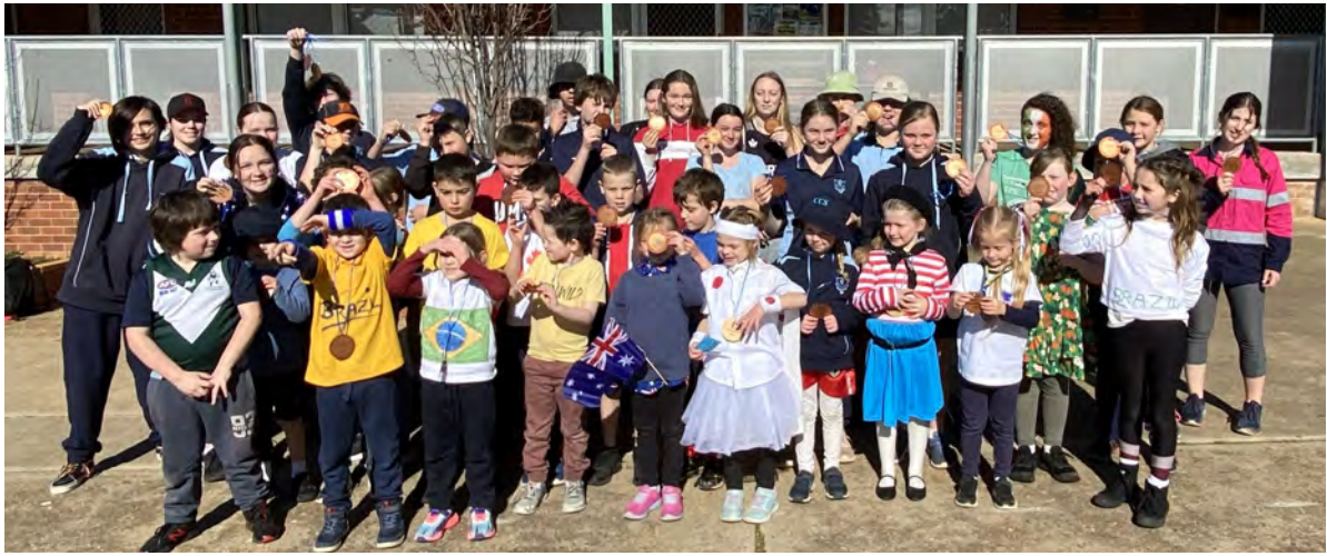
Bronze Medal Winners