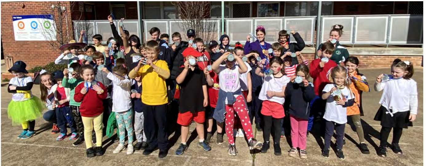
Silver Medal Winners