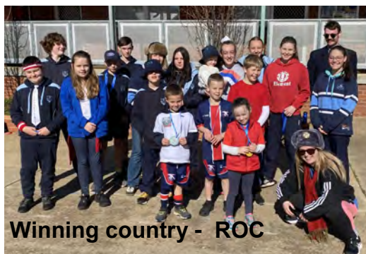
Winning country - ROC