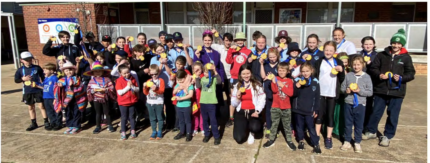
Gold Medal Winners