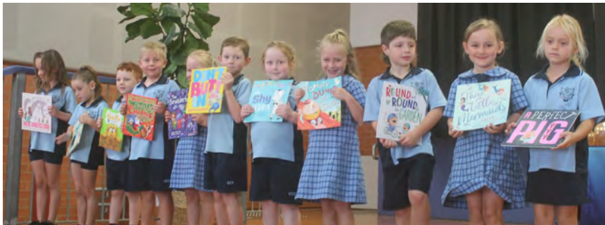
Kindergarten students from Garnet