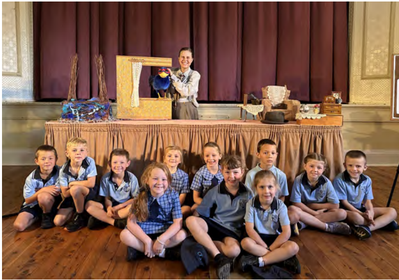
K-2 students recently travelled to Ganmain for a puppet show and lunch for their wellbeing excursion.