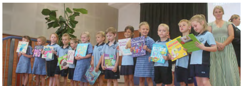
Kindergarten students from Emerald