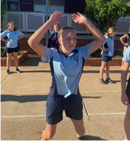
Secondary staff and students jumped into their Monday with the return of PE Pump.