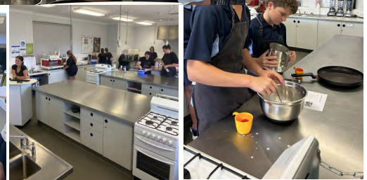
Year 11 Industrial Technology