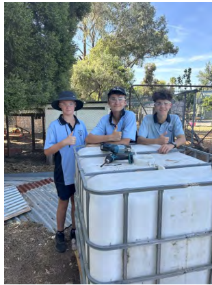
Stage 5 iSTEM