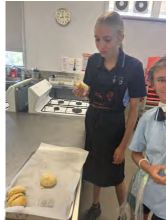
Stage 4 Techman