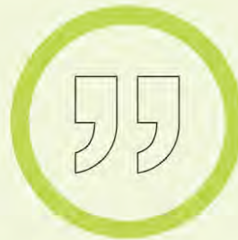
Conventions of language (spelling, grammar and punctuation)