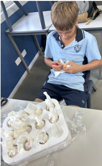
Stage 5 Ag