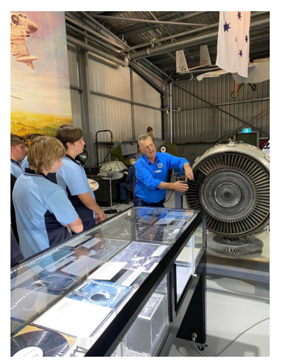
The 9/10 iSTEM class enjoyed a day out learning about different aspects of engineering by applying them to real life problems.