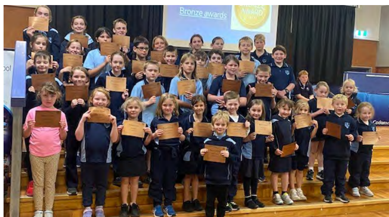
Bronze award winners