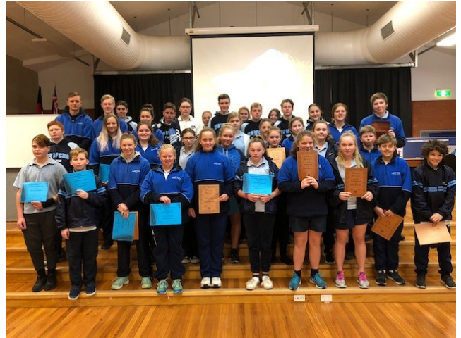
Several of our high school students received their Bronze level achievement.