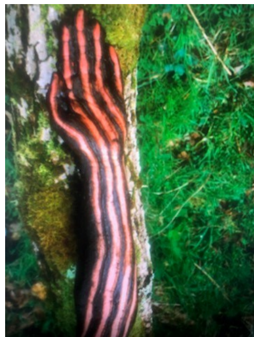
Above: Andy Goldsworthy Original