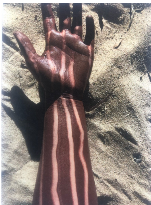
Stage 5 interpretations using natural materials.